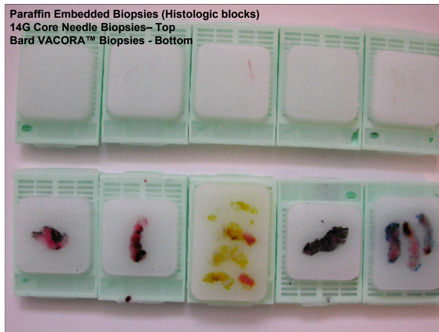
Fig 2. Paraffin embedded biopsies (histologic blocks) 14G Core Needle Biopsies – Top BARD® Biopsy System VACORA™ Breast Biopsy System Biopsies - Bottom

Our group includes two board certified cytopathologists. Both are experienced and extremely knowledgeable with regards to breast FNAs. They agreed with my assessment. My non-cytopathologist partners were equally enthusiastic. The VACORA™ Breast Biopsy System produces a superior sample that is easier to interpret and which allows for accurate ancillary testing of breast carcinoma cases. I recommend it without reservation for all ultrasound directed core needle biopsies of the breast.